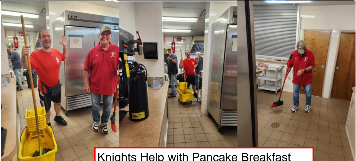
Knights Help with Pancake Breakfast For the Children's Breakfast with Santa