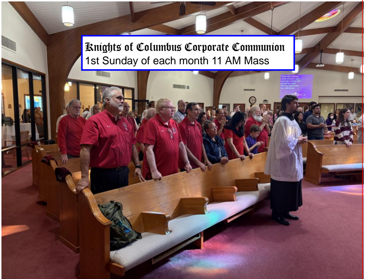
Knights of Columbus Corporate Communion 1st Sunday of each month 11 AM Mass