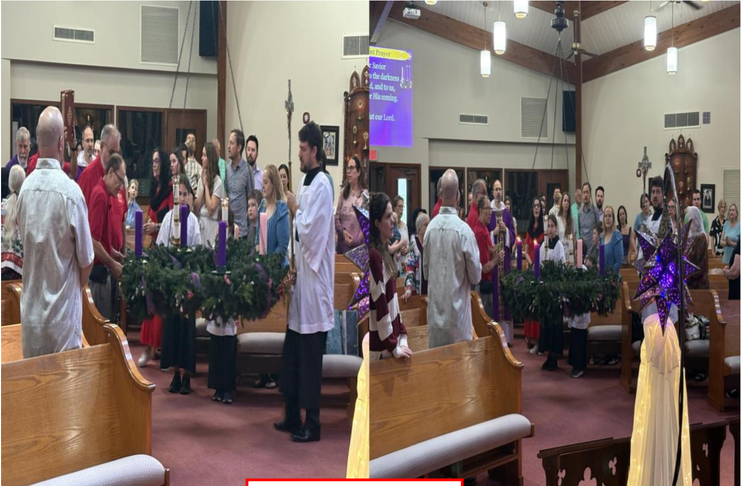
Corporate Communion 1st Sunday December