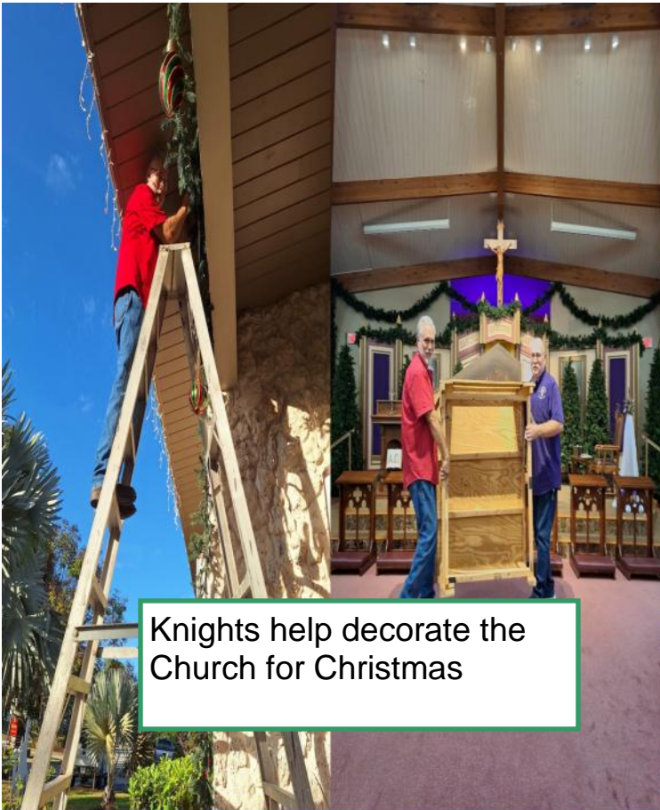
Knights help decorate the Church for Christmas