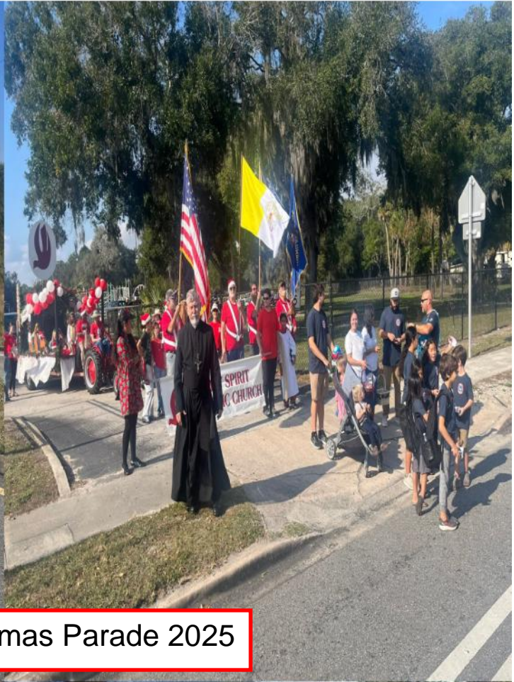
Mims Christmas Parade 2025