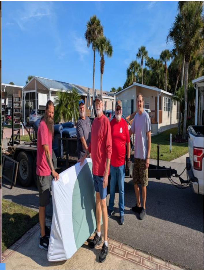
Knights help move furniture for a lady in the community.